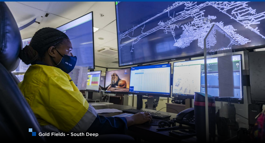
Gold Fields - South Deep

In 2020, the industry saw an 18% regression in fatalities with 60 compared to the 51 in 2019.